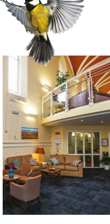
St. Pappin's • Ballymun